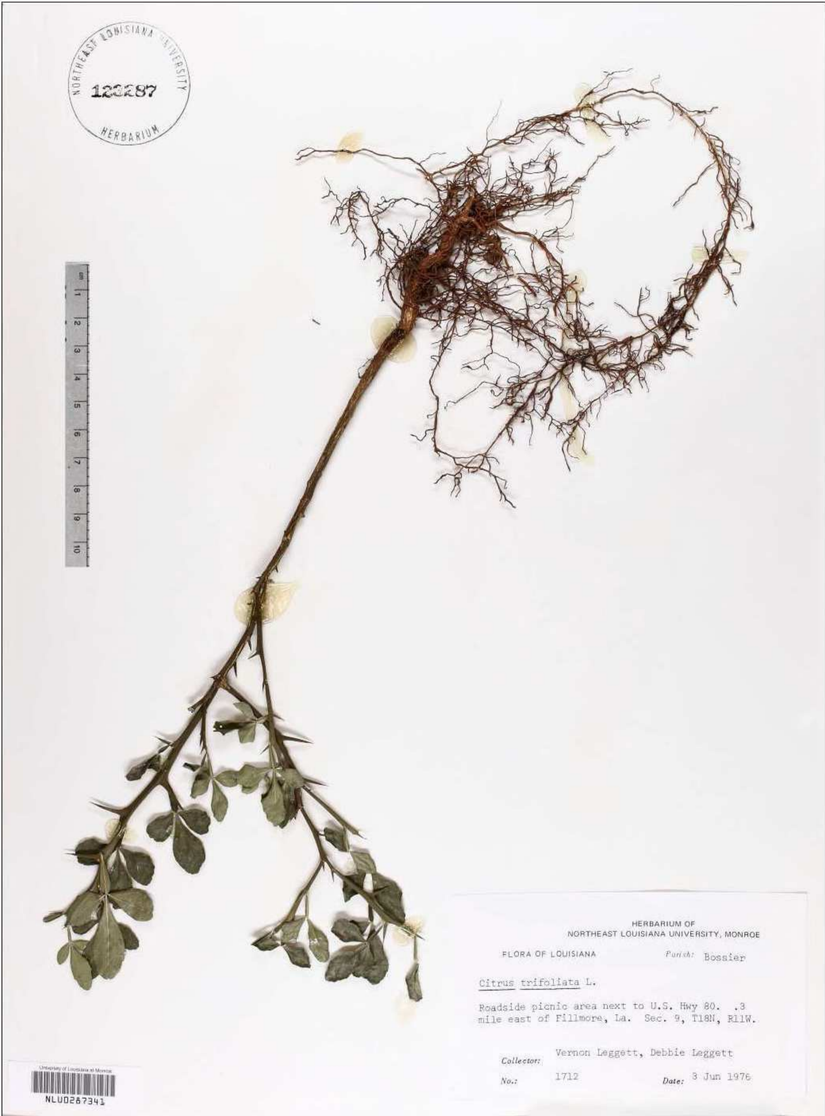
Figure 5. Sapling of trifoliolate orange, probably 2-3 years old.